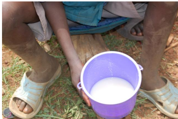
(Common porridge meal)

Serve porridge, the food eaten by many orphans, and show an orphan-themed movie followed by group discussion.